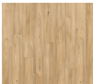
Malibu Chestnut NEUP03