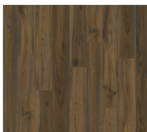
Slate Rock Walnut NEUP12