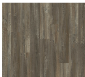
Salt Glaze Oak NEUP14