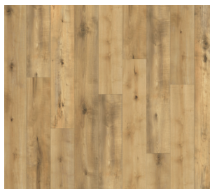
Vermont Maple NEUP04